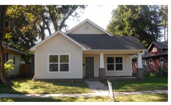
1218 West 9<sup>th</sup> Street 3 Bedroom 2 Bath 1 Car Garage Price: $90,000